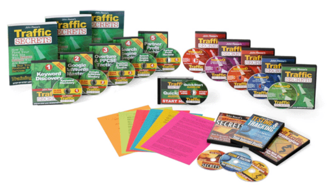
Finally! My long-awaited "Traffic Secrets" home study course is ready for its